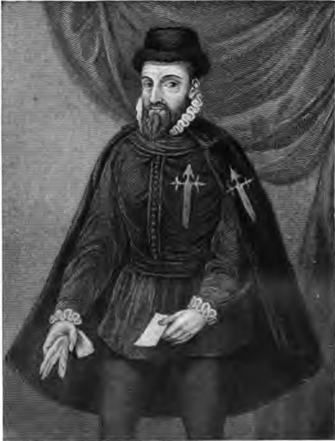
FRANCISCO PIZARRO, CONQUEROR OF PERU